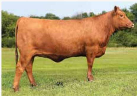
Red Combest Lucy 401B • Maternal sister

Red Combest Domino 824F is from a proven maternal pedigree that is well-documented. Red LLB Lucy 716Z is having a stellar career in the Combest lineup of breeding females. A maternal sister to the bull that sells as this lot is the $20,000 bred heifer that sold through the Combest Dispersal to J6 Farms. Some of the best cow families in North America are represented in the pedigree of this breeding bull.