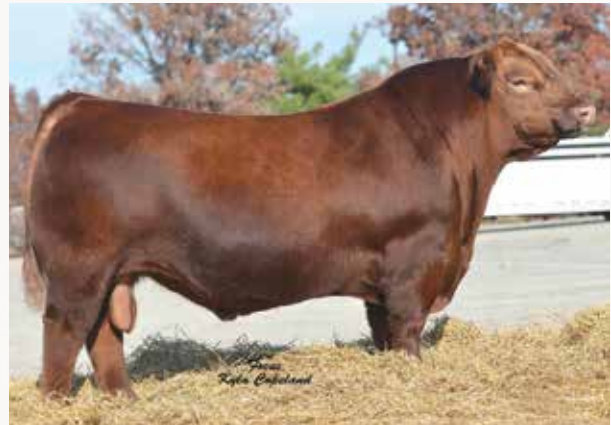
Red Silveiras Mission Nexus • Sire

Red Combest Nexus 833F is an impressive breeding bull, and he represents the most popular lines in the industry. Both sire and dam are among the stand out individuals in the Red Angus breed. Red Silveiras Mission Nexus has become one of the most popular breeding bulls ever utilized in the Red Angus breed. His progeny excel in every aspect of the industry, and his influence is gaining momentum and appreciation each day.