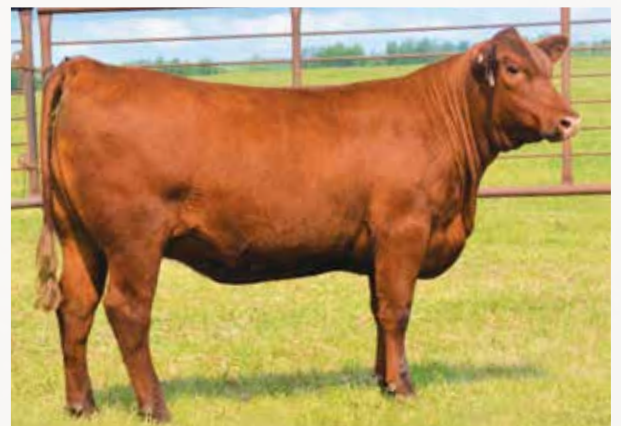
Red MTC Alayna 6047 • Dam

Red MTC Alayna 6047 is a unique breeding female, and she was bred in the Mitch and Jody Campbell program before she became a part of the breeding program at Combest Farms. The balance and scope of the genetic profile from this female makes her son a worthy herd sire individual for breeder herds throughout North America.