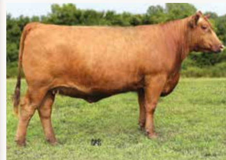
Red Combest Alysa 440B • Maternal sister

Red Combest Concept 831F is a son of Bar-E-L Concept 831F. His dam, Red Ter-Ron Alysa 91X, has proven her significance through the success of her progeny on several instances. A maternal sister was the high-selling lot in the Combest Dispersal and sold to Twin Willow Farms for $30,000. This is a complete and reliable genetic package.