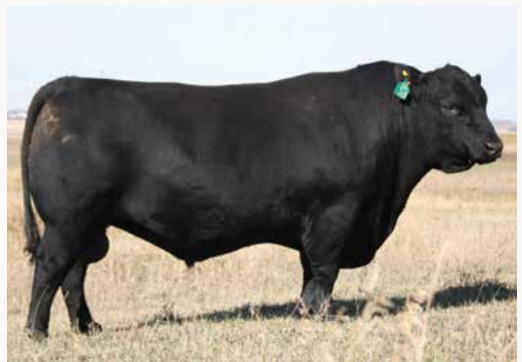
Little Valley Resource 6C • Sire

11F is a stylish Resource bull. He's moderate framed with plenty of depth of body and muscle shape. He's a moderate birth weight bull backed by performance, moderate EPDs across the board and the great Blackcap cow family.