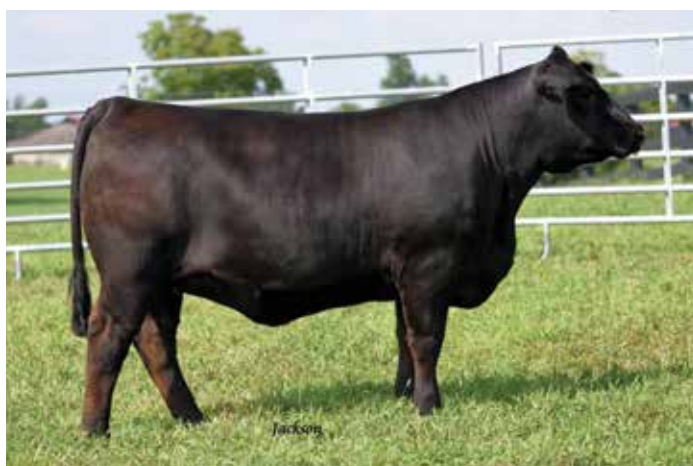
LOT 43 - HB ZINTLEY 730E

HB Unique 722E ET is a bred female of the highest quality and genetic derivation. Both sire and dam are among the most appreciated and well documented individuals in the herd book and the North American Limousin Foundation. From this ET mating, the female that is offered here is an exceptional breeding female. The MAGS Aviator progeny are among the most popular individuals in the breed, and this female is one of the top ones around sired by the great son of MAGS Winston. Her dam has become one of the most highly proven Lim-Flex females, and she is backed with some of the most high profiled individuals in the breed. This is a powerful female from a remarkable genetic source.