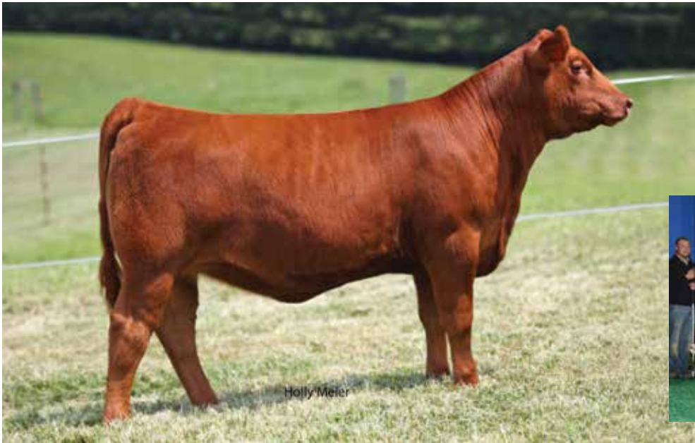
LOT 3 - 3ACES FIONA 4308