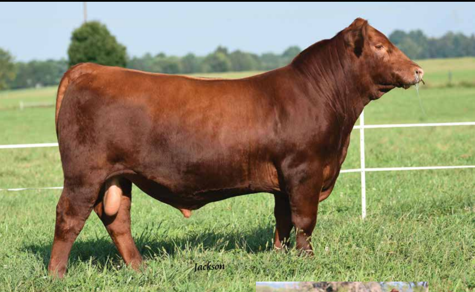
LOT 16 - HB EXTRA EFFORT 766E