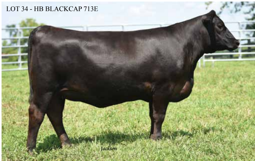
LOT 34 - HB BLACKCAP 713E

HB Blackbird 713E is an attractive daughter of RB Tour of Duty 177. This is one of the top replacement females in the entire herd, and she was selected as fine addition to the sale inventory lineup. She traces to an efficient female generated in the Bridgeview Angus program.