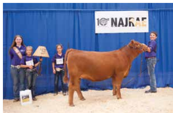
3ACES Blossom 9214 - Dam of Lot 8