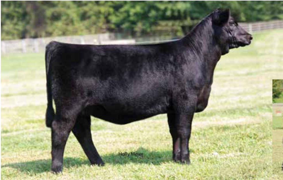
LOT 21 - 3ACES SHADOE 4018

Champion Hill Shadoe 2062 - Maternal Granddam of Lot 21