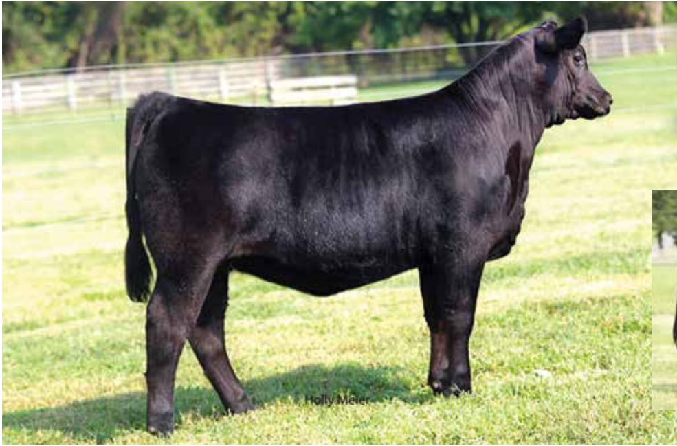
LOT 19 - 3 ACES GEORGINA 3018

Champion Hill Georgina 6318 - Dam of Lots 19 & 20