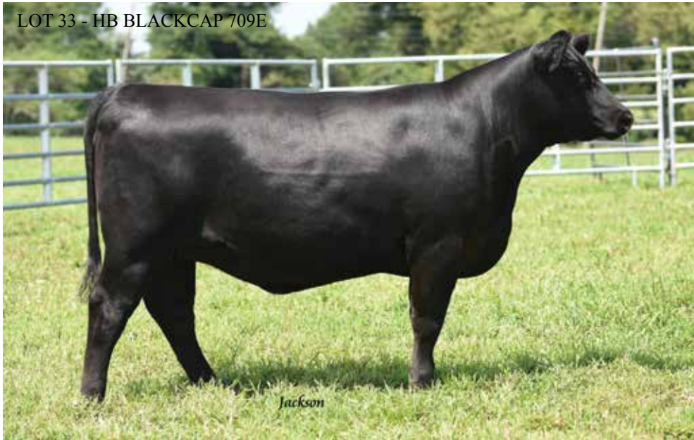
LOT 33 - HB BLACKCAP 709E