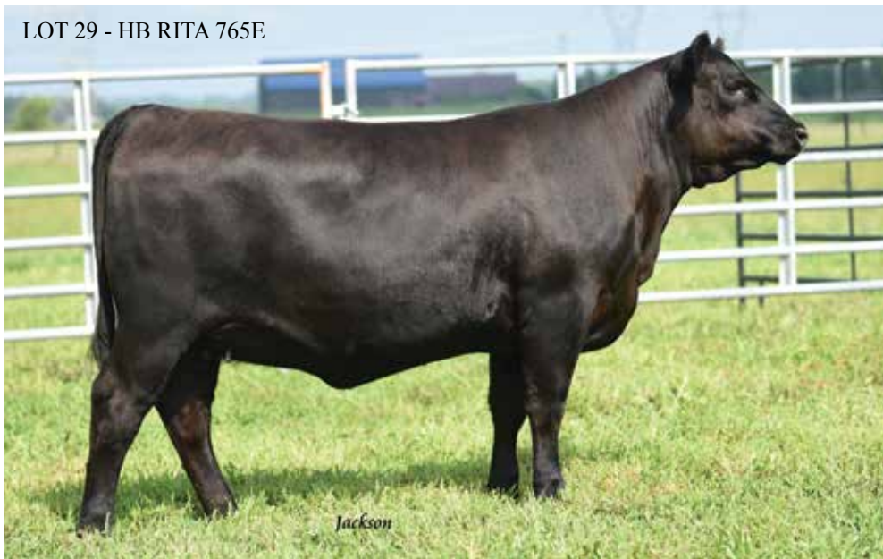
LOT 29 - HB RITA 765E

HB Rita 765E is a member of the HB Rita 179Y cow family that has made a big impact upon the breeding program of Angus at HB Farms. Breed-leading females such as this have stood the test of time and have contributed extensively to the breeding program. This is a complete genetic package from the heart of the herd at HB Farms.