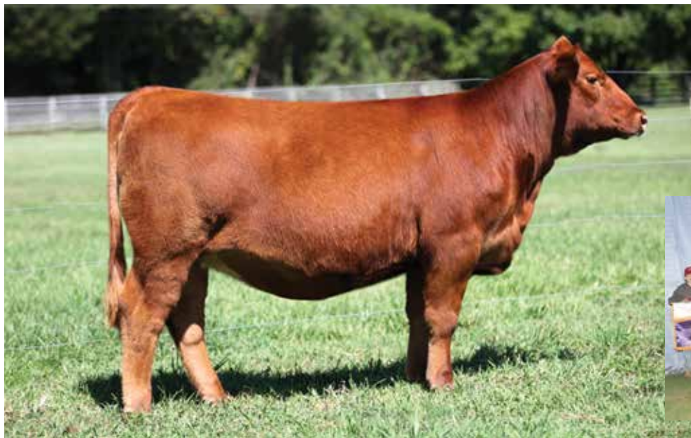
LOT 9 - 3ACES TINKERBELL 9307

3ACES Tinkerbelle 9236 - Maternal Sister to the dam of Lot 9