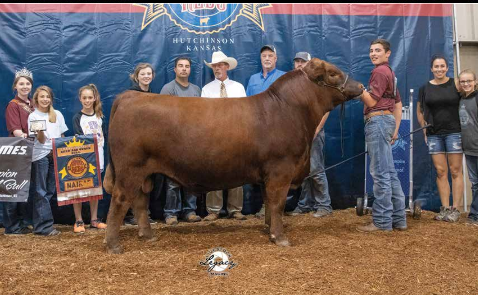
LOT 15 - 3 ACES FEEL GOOD 2607 Grand Champion Bred and Owned Bull 2018 NAJRAE