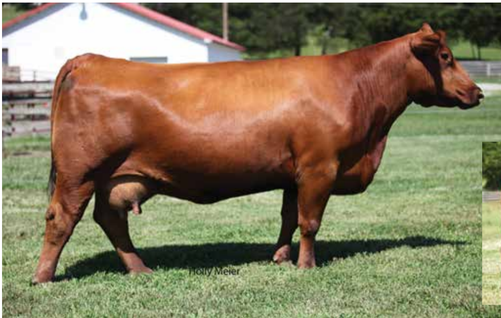
LOT 2 - TC 3 ACES FIONA 90Z