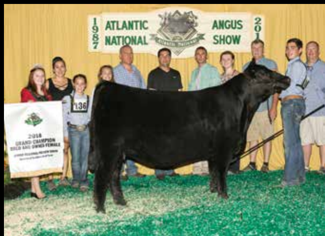
3ACES SHADOW 9056

Champion Bred & Owned Female - 2018 Atlantic National Jr. Angus Show