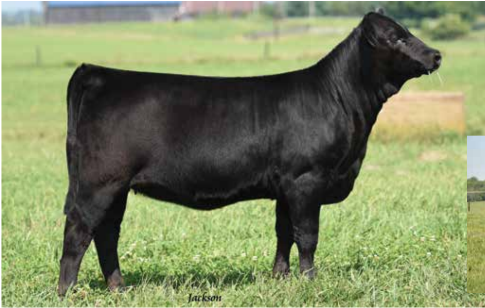
LOT 36 - HB AVALON 826F ET