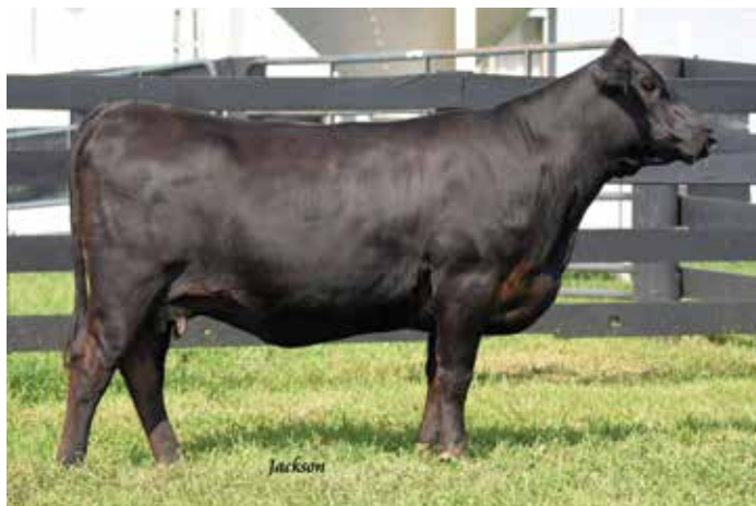
LOT 47 - WLBL DUCHESS 662D

WLBL Duchess 662D has absolutely eye-popping EPDs built from some of the most intriguing genetics available in the industry. She is from the long line of greatness from EXLR 199H, one of the most prolific and fertile family lines in the breed. Every line of the pedigree of this great young female extends stability to this trait-leading individual, and few females in the breed has the pedigree depth as does this individual. Her bull calf at side by MAGS Y-Axis has the foundation of an excellent herd sire, and this is one of the perfected individuals in the breeding herd.