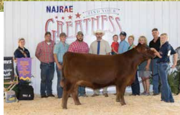
ENG D Cruel Girl 5032C - Maternal Sister to Lot 1 Reserve Champion Owned Female - 2016 NAJRAE

RED TER-RON RELOAD 703T RED K ADAMS SAVANAH 11S RED FINE LINE MULBERRY 26P DAMAR PRIDE U848