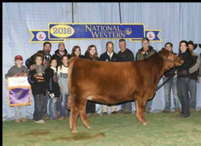
3ACES TINKERBELL 9236

Grand Champion 2018 Kentucky Beef Expo Jr. Show Res. Champion 2018 Eastern Regional and 2018 Summer Classic