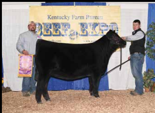
WLBL BLACKCAP 725E

Champion Bred & Owned Female - 2018 Atlantic National Jr. Angus Show