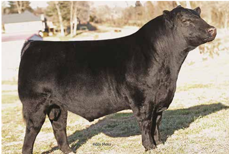
FCF Intuition 345 - Sire of Lots 23 & 24