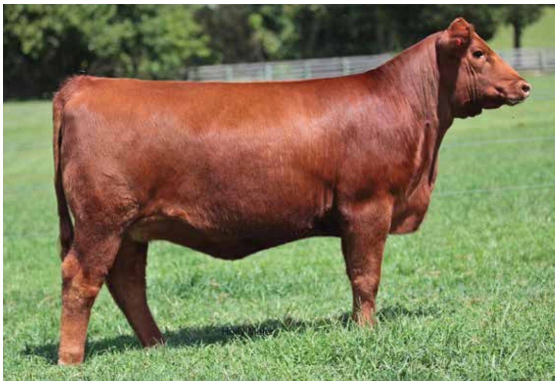
LOT 7 - 3ACES QUEEN 9287