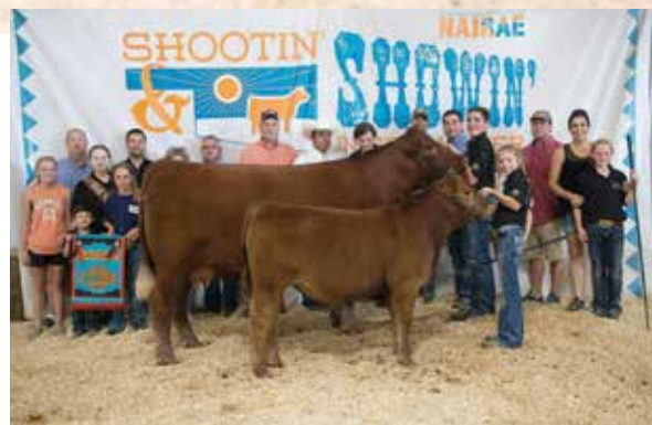
Lot 14 - Top Line Red Princess 4041 Supreme Champion 2017 NAJRAE

BUF CRK HOB0 1413 BUF CR CARRIE VC1174 J BAR 7 GRAND CANYON 2222 LANA GAL N78 RED LAZY MC STOUT 30S RED TOWAW MONIQUE 2K RED SVR KNIGHT 73P RED CORNERSTONE NETTIE 324P