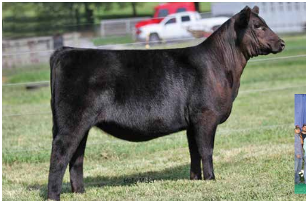
LOT 22 - 3ACES OLC SHADOE 4038

3 Aces OLC Shadoe 4038 is a superb April heifer calf sired by the one and only Gambles Hot Rod. The sensational breeding bull has left some of the most noted individuals in the breed. A full sister to the heifer that sells here was the Grand Champion Female at the 2012 NAILE Junior Show. Her dam, was a tremendous and celebrated show heifer before becoming a noted and proven donor female from the Shadoe cow family.