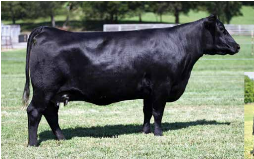
LOT 18 - 3 ACES LADY 1065