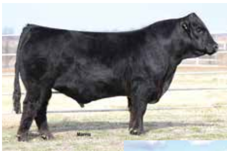
MAGS Anchor Sire of Lot 49

HB Gal 680D is a first calf heifer with a flashy heifer calf at side by MAGS Aviator. The genetic combination represented here has resulted in this excellent young, hard working female. She is from some of the longest and oldest lines of both Limousin and Angus pedigrees that serve as the foundation platform for this young Limousin lot. With her life in front of her, she shall prove to be an excellent investment, and her heifer calf at side indicates she is off to a great start.