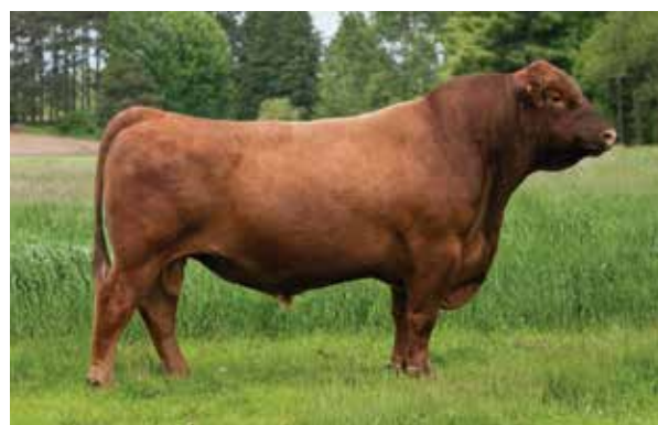
BHR Durango 1158 - Sire of Lot 7

3 Aces Blossom 9297 is from championship lineage created in the 3 Aces breeding program. The daughter of BHR Durango 1158 is from 3 Aces Blossom 9214, the Reserve Division Champion at the 2014 NAJRAE. The complete package of genotype and phenotype is in balance with this yearling heifer. Her balanced EPDS are yet another indication of the earning power of this female. Her show career and level of future production combine to make an outstanding breeding female.