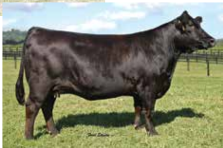
TMCK Appreciation 315A Dam of Lot 49