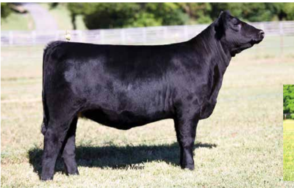
LOT 27 - 3 ACES ENAMEL 9017

3 Aces Enamel 9017 is from Majestic Enamel A318, the Dameron First Class daughter. This October heifer calf is a yearling heifer that will fit perfectly in those fall classes. She is bred from some of the most exciting individuals in the industry, which serves as a great foundation base for this female to launch her career.