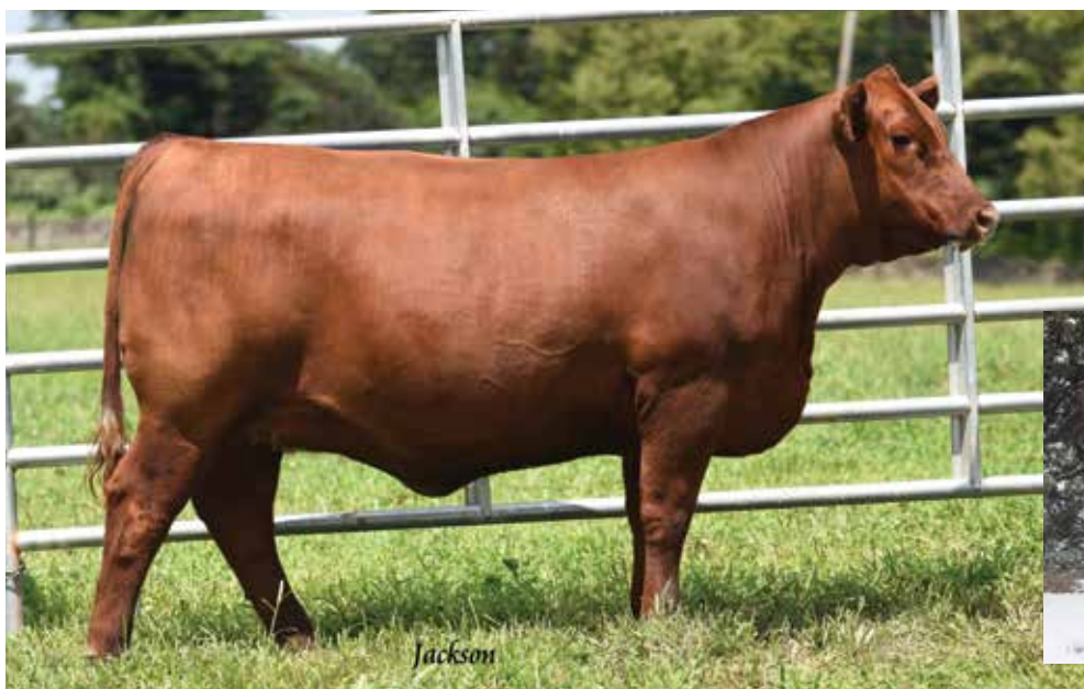
LOT 12 - HBBH LAINEY 744E

AI 5/6 to LSF BRA No Worries 4657B - HBBH Lainey 744E is an impressive bred female from the HB program. She is sired by the former many times champion AHL Flashback 446D. The son of PZC TMAS Firestorm 446B has become one of the great breeding bulls in the industry, and his progeny are among the breed's most appreciated. Her dam, Damar Y139 Lainey A271, is one of the top producing females in the HB program. This is one top bred females to sell this year. Balanced EPDs and phenotype are harmonious with this excellent female.