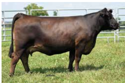
LOT 38 WLBL BLACKCAP 523C ET