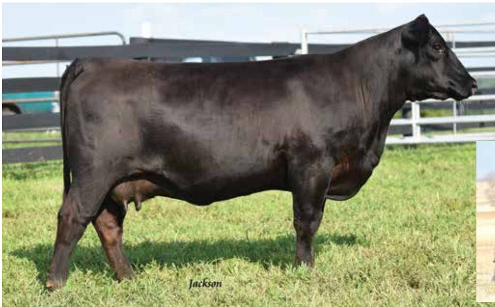
LOT 40 - WLBL AVALON 630D