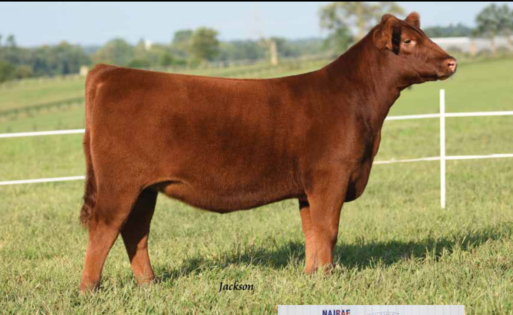
LOT 1 - HB FANTASY 802F