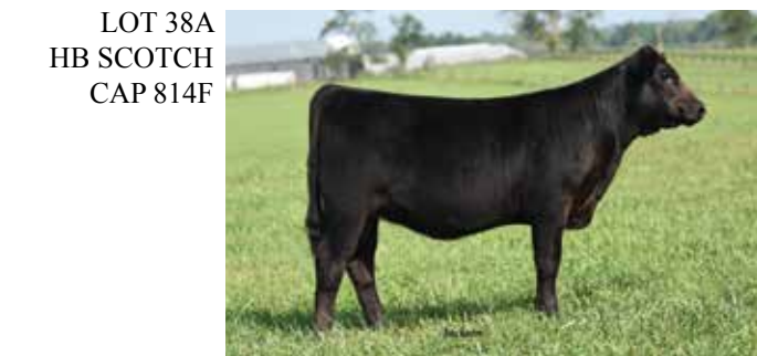
LOT 38A HB SCOTCH CAP 814F

HB Scotch Cap 634D and her heifer calf by MAGS Aviator make a pair of exceptional quality and exclusiveness. The dam is a two year old female from the Scotch Cap family line that never misses. She combines all genetic pieces that help make up the completeness and progressiveness that are affiliated with this exceptional lineage. She has at her side a most competitive show heifer prospect and genetic individual for the future of the industry. Both mother and daughter are fine examples of the HB breeding herd, and they are a part of the sale line up as featured individuals.