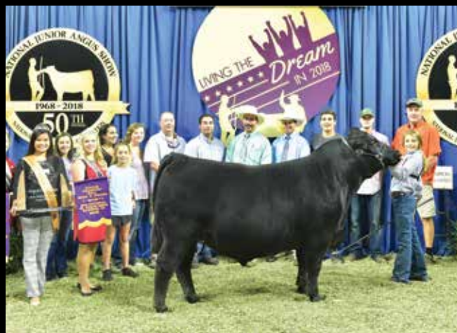
3ACES WILDCAT 1507

$10,000 Top Seller in the 2017 HB Farms Sale going to Long Hall Cattle and a granddaughter of Red Soo Line Annie 7249