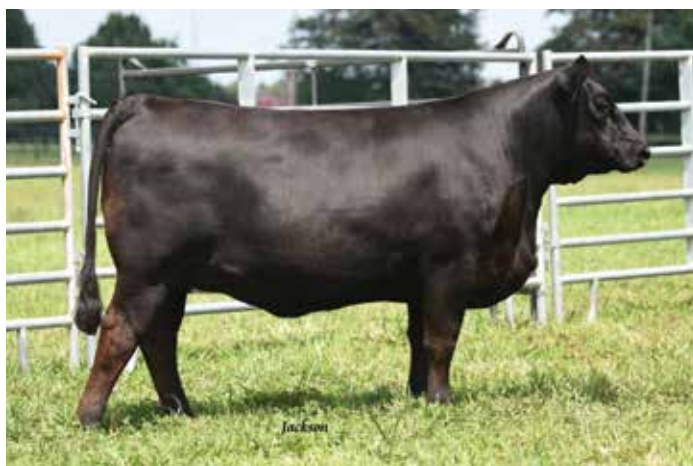
LOT 42 - HB UNIQUE 722E ET