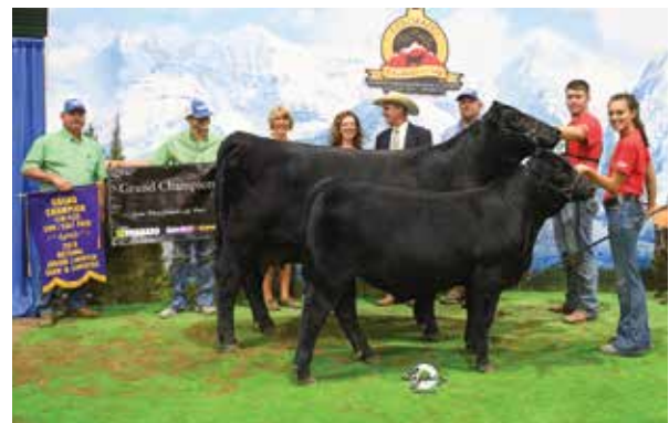
WLBL Avalon 608D ET