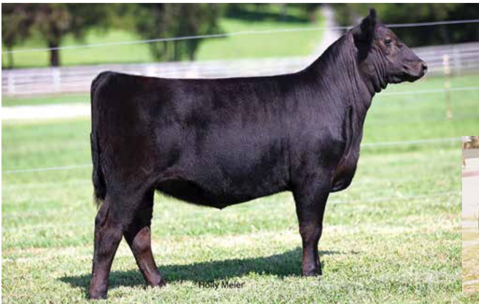
LOT 20 - 3 ACES GEORGINA 4028

3 Aces Georgina 3018 and 3 Aces Georgina 4028 are full sisters born into one of the greatest cow families of any breed anywhere. Their dam, Champion Hill Goergina 6318 is a cornerstone donor female from a powerful cow family that has generated countless champions and monumental seedstock sources for the entire Angus breed. The influence of this great family has been an overwhelmingly positive influence in the industry, and the two heifer calves that sell as lots 19 and 20 are significant additions to the entire cow family. A full sister, 3 Aces Georgina 2017, was a class winner at the 2018 NJAS. The March and April-born heifer calves sell as two of the most exciting prospects to sell this fall. Perfection at every turn makes these individuals ready for prime time.