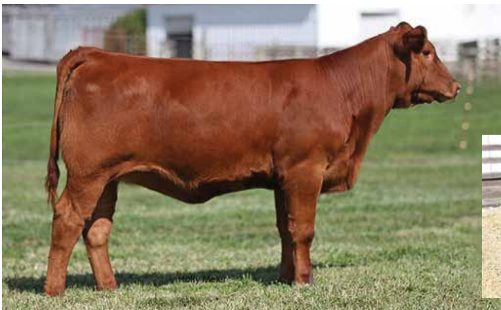
LOT 2A - 3 ACES FIONA 5308

3 Aces Fiona 5308 is a spectacular heifer calf sired by SPUR Gravity 601 2441C, the lead off bull for the 2016 Reserve Grand Champion Pen of Bulls at the National Western Stock Show, shown by Silver Spur Ranches. The breeding bull, in turn, was used selectively in the 3 Aces breeding program with outstanding results. This late May heifer calf is showing great promise, and she is has become one of the favorites at the farm. She combines all the attributes of a winner, and she will be a most competitive female for years to come.