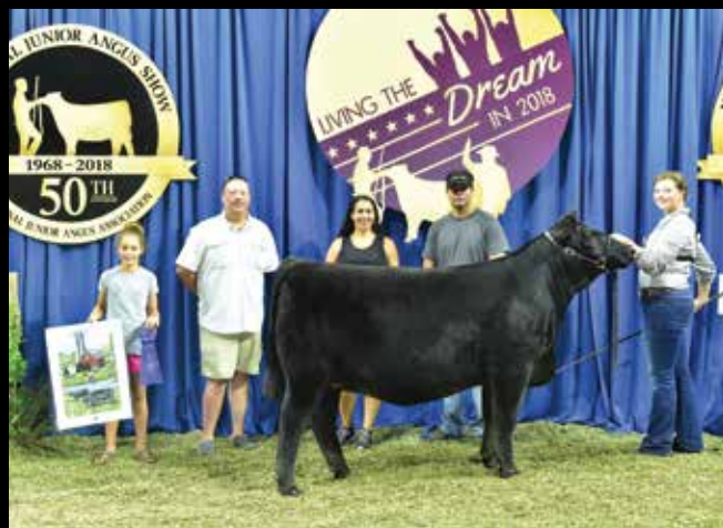
3ACES GEORGINA 2017

Grand Champion Red Angus Female - 2018 National Western Open Show