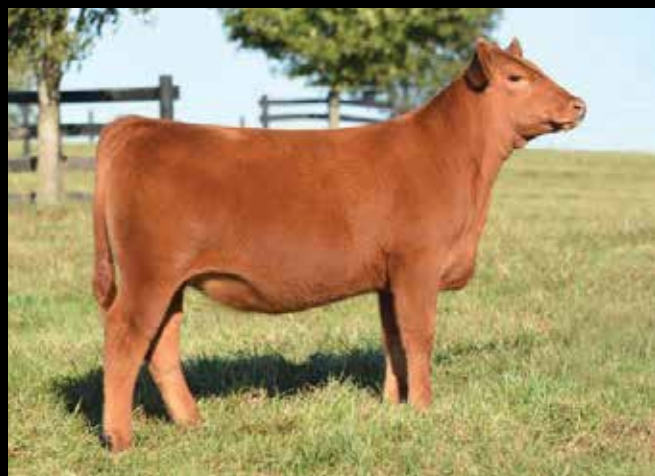
HB ANNIE 729E

$10,000 Top Seller in the 2017 HB Farms Sale going to Long Hall Cattle and a granddaughter of Red Soo Line Annie 7249