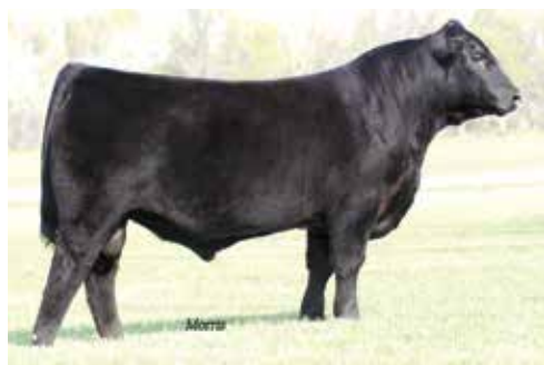
MAGS Y-Axis - Sire of Lot 48

WLBL Duchess 662D has absolutely eye-popping EPDs built from some of the most intriguing genetics available in the industry. She is from the long line of greatness from EXLR 199H, one of the most prolific and fertile family lines in the breed. Every line of the pedigree of this great young female extends stability to this trait-leading individual, and few females in the breed has the pedigree depth as does this individual. Her bull calf at side by MAGS Y-Axis has the foundation of an excellent herd sire, and this is one of the perfected individuals in the breeding herd.