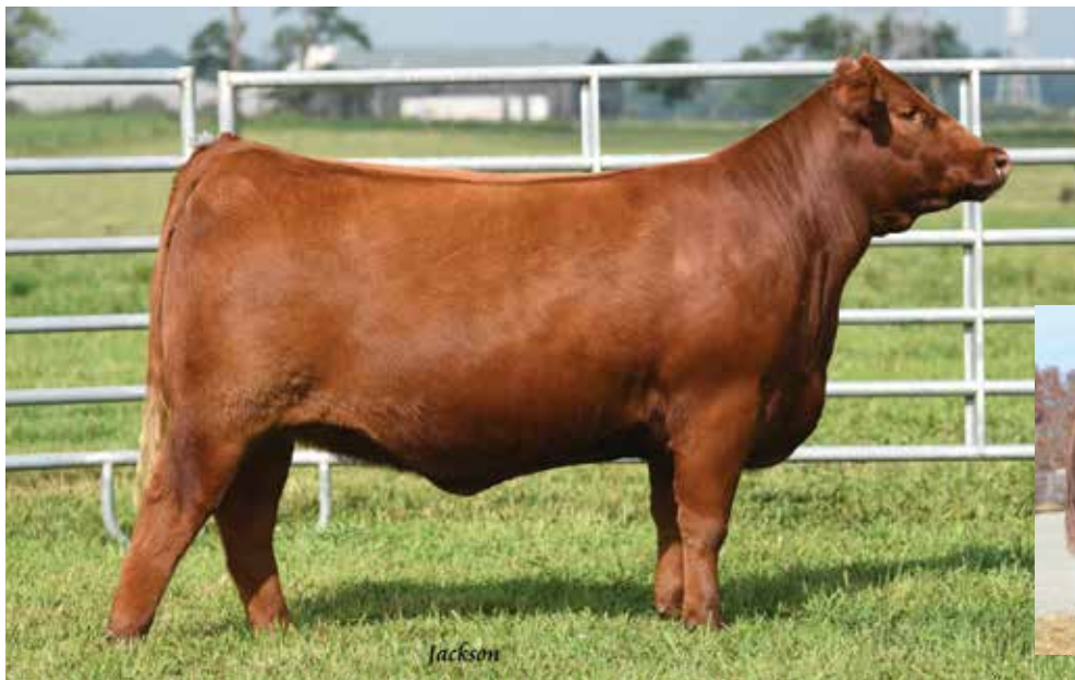
LOT 11 - BHF VENUS 10E OFFERING HALF INTEREST

Silveiras Mission Nexu 1378 - Sire of Lot 11