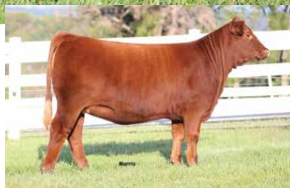
J Bar J Cat Tail 551C - Maternal Sister to Lot 16

From the ET program at HB Farms, this exceptional herd sire and breeding bull has made it's way to the top. HB Extra Effort 766E was born in an impressive and exciting group of ET calves. The dark red and boldly constructed bull captured the Grand Championship at the 2018 Kentucky State Fair, the one and only time he has been shown. He is a combination of some of the breed's very best lineage, and he has developed into one of the best sons of Bieber Deep End B597. His donor dam is a moderate and perfectly designed female sired by NBAR Hamley S913. Her level of production has earned her the right to be one of the significant donor females in the HB program. He was born into an elite group of individuals. His maternal sister, J BAR J Cattail, was the Division Champion Female at the 2016 NAJRAE. She is now a donor female in the Blair.AG Cattle Company. This is a most ambitious breeding bull offered by HB Farms.