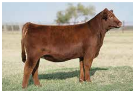
Red U-2 Moulin Rouge 351C Daughter of Lot 13 Sold to Colton Barton for $28,500