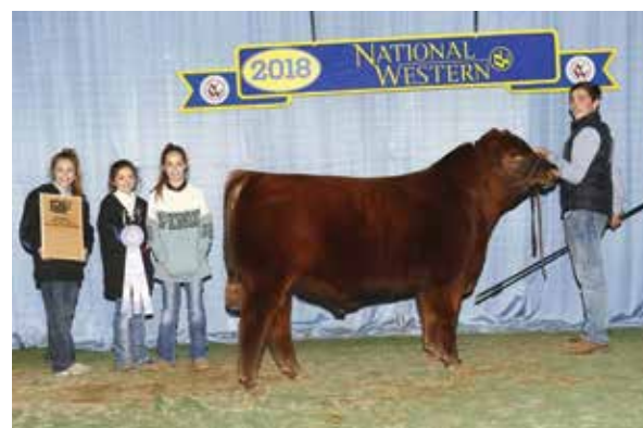
Lot 15 - 3 ACES Feel Good 2607 Reserve Winter Bull Calf Champion 2018 National Western Stock Show