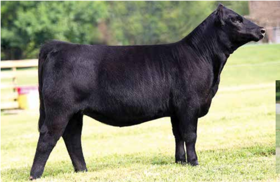
LOT 26 - 3 ACES GEORGINA

Gambles SS Georgina 1070 - Maternal Granddam to Lot 26