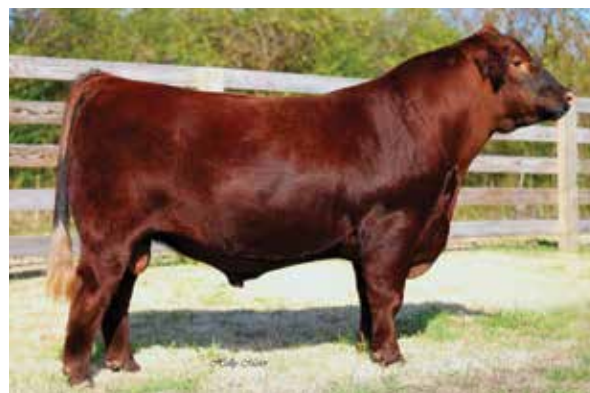
3 ACES Sidways - Sire of Lot 14