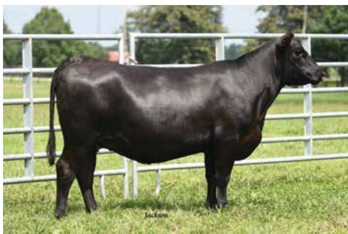
LOT 32 - HB DAISEY 651D

HB Eota 569C is the PA Full Power 1208 daughter from the Eota cow family line. She combines some of the best genotype and phenotype in the Angus industry, and this young female will prove to be an exceptional investment for years to come. She has nicely balanced numbers and EPDS to serve as tremendous foundation female for future generations to come.