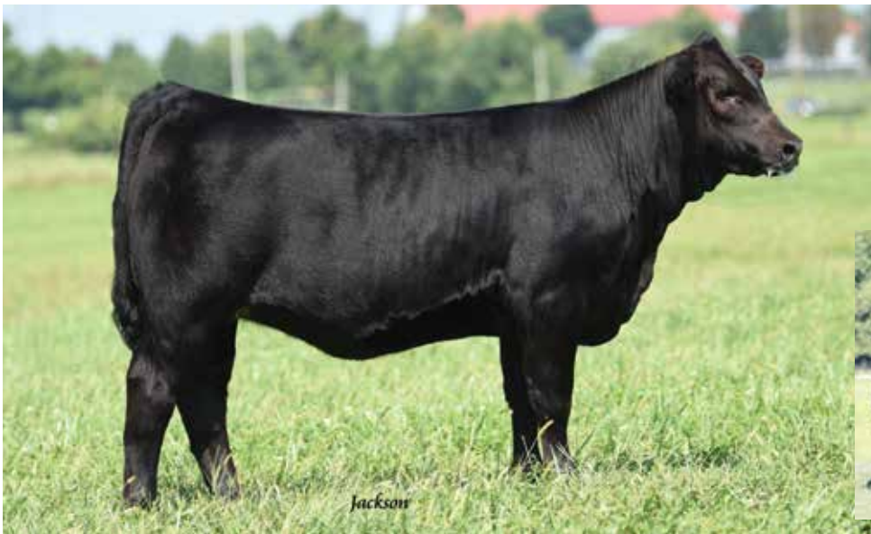
LOT 37 - HB WILLA 819F

HB Willa 819F is a purebred show heifer prospect sired by the noted breeding sire, AUTO Cruze 132X. She shares her heritage with some of the most successful individuals in the industry, and the influence of this great breeding sire has become wide spread and appreciated throughout the industry. She has been a standout female since the very beginning, and this young female will continue to develop into a competitive show heifer and efficient breeding female. Her dam, CFLX Willa 124Y, is a good milking daughter of Sennett Wonderful 857U. She traces to some of the all time greats working in the Council breeding program. Substantial EPDs for balanced trait selection are a part of this purebred pedigree, and she shows the promise of super star.