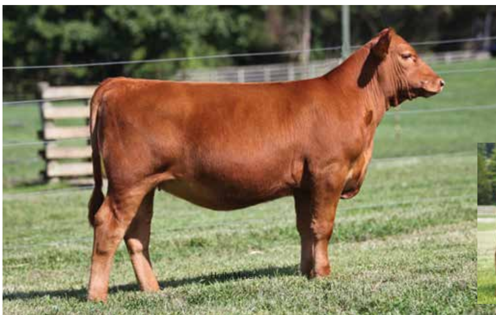
LOT 6 - 3 ACES OLC LANA 2308

3 Aces OLC Lana 2308 is the February daughter of WEBR Night Train 324, the popular breeding bull sired by WEBR Doc Holliday 2N. Her dam, 3 Aces Lana 2904 is a daughter of Trowbridge Lana 707 and maternal sister to 3 Aces Sideways. The tremendous lineage associated with this female represents some of the most revered names in the industry. This cow family has been responsible for some of the greatest of all individuals that have built the foundation of the breed. This female is one of the best ever born from this exclusive cow family and female groups.