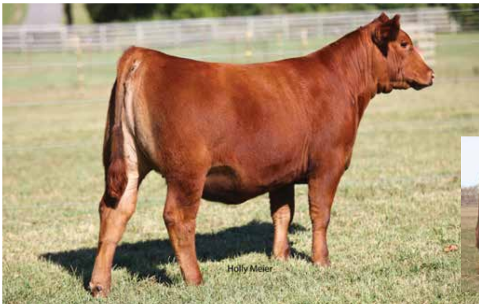
LOT 5 - 3 ACES DAISY 3308

WEBR Doc Holliday 2N - Maternal Grandsire of Lot 5