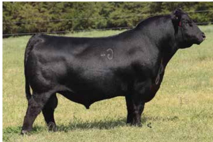
GCC New Game 5654C - Sire of Lot 25

3 Aces RBF Blackcap 3258 is the late March heifer calf from a solid producing Backcap female that has added yet even more genetic dimension to the pedigree base. The FCF Intuition 345 daughter has the strongest of pedigree lineage to add stability to the brilliant profile of this prospect.