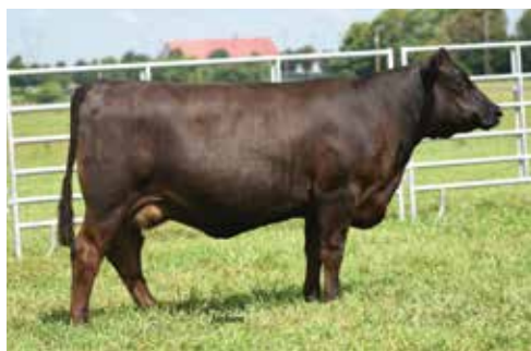
LOT 39 HB SCOTCH CAP 634D