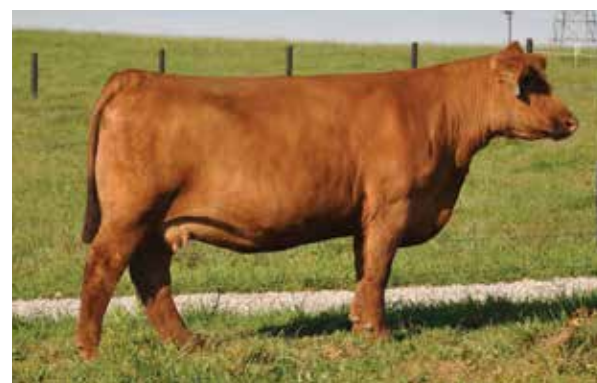
Damar X056 Pride 01W A274 - Dam of Lot 1