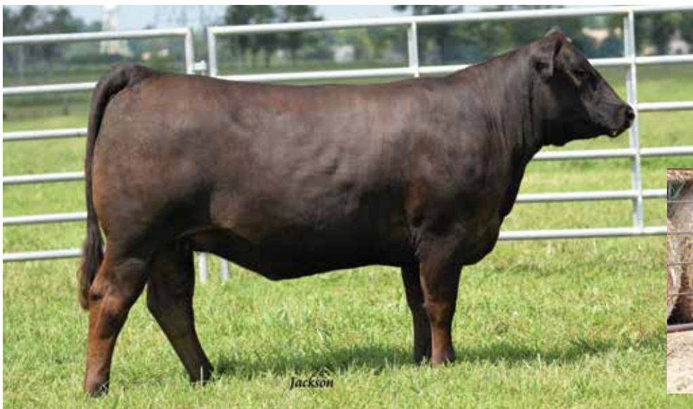
LOT 41 - HB WILLA 701E

HB Willa 701E is a purebred female of the highest quality and breed identification. She is the daughter of SYES Backstage 466B, and she is the only offspring in the sale offering sired by the great breeding son of DLVL Xerox 023X. This purebred female is from HB Willa 517C, the proven brood cow in the HB breeding program. This is a combination female that offers foundation purebred genetics in an attractive package. She will calve early next year with her first calf.