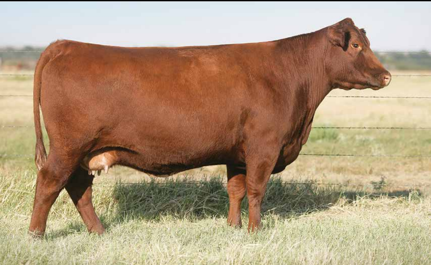
LOT 13 - RED U-2 MISTY 160X