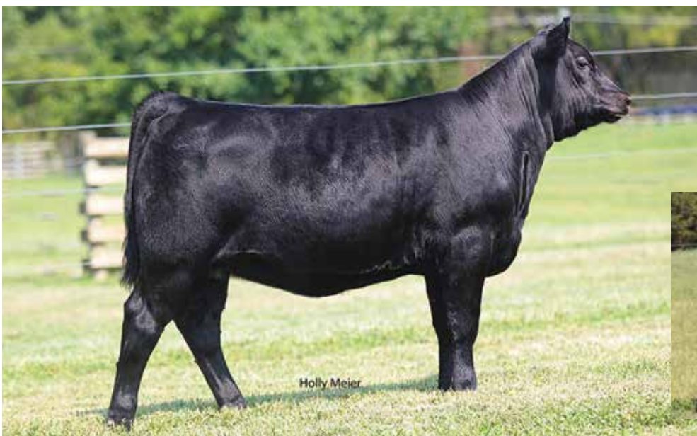
LOT 18A - 3 ACES LADY 5018

3 Aces Lady 5018 is the May-born heifer calf at the side of her dam. The daughter of GCC New Game 5654C sells as a standout show heifer prospect from this magnificent line of females. The impressively balanced and attractively designed female carries on the tradition of quality synonymous with this noted female line.