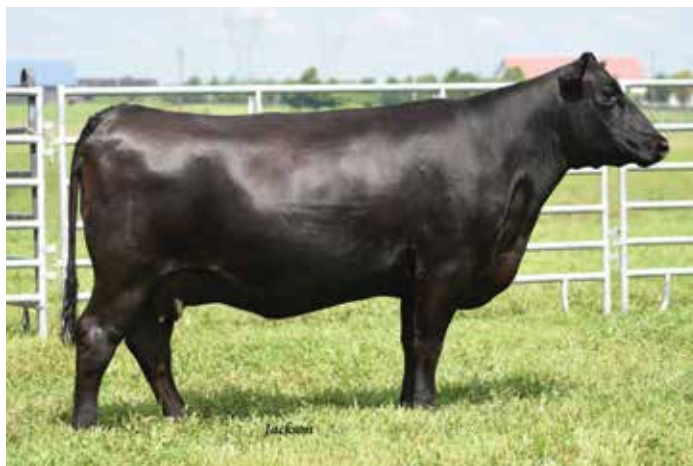
LOT 30 - HB RITA 465B