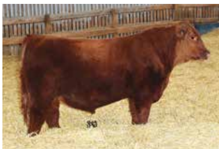
Red U-2 High Roller 178D Son of Lot 13 Sold to DC Angus for $12,500