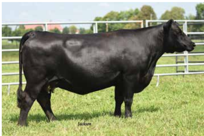
LOT 31 - HB EOTA 569C

HB Rita 465B is a member of the HB Rita 179Y cow family, and the foundation female has contributed greatly to the success of the program, and three direct daughters and granddaughters are a part of this sale offering. Her daughter by Quaker Hill Rampage OA36 sells as lot 28. This female has great earning power and she sells a noteworthy lot in the Angus division of the sale inventory.