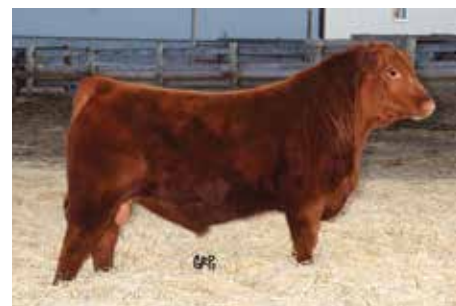
Red U-2 Renown 577E Son of Lot 13 Sold to Howe Red Angus for $10,500