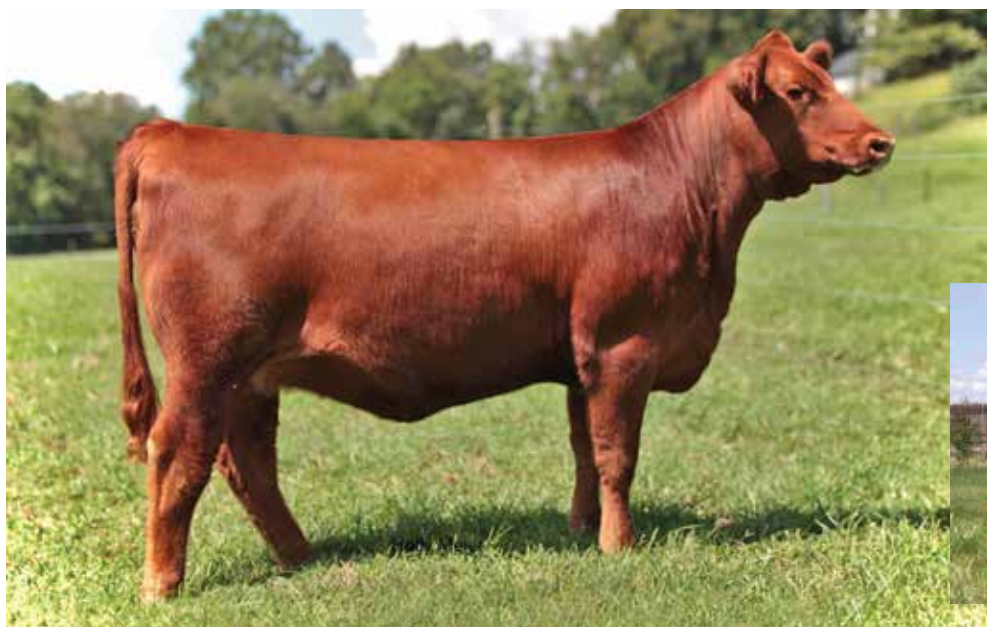
LOT 10 - 3ACES BLOCKANA 9317

3 Aces Blockana 9317 is an October yearling female by SPUR Gravity 601 2441C from the Blockana cow family. Majestic Blockana B103 is the daughter of Red Lazy MC Cowboy Cut 26U and Majestic Blockana B103. This familiar and popular cow family has become one of the family lines responsible for some of the most dynamic progress in the Red Angus industry. The females were one of the most significant lines of females that fueled the success and excitement in the Majestic Meadows. This female is steeped with past show winners and breed leaders that have been scattered across North America.