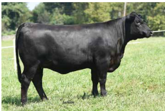
LOT 44 - HB BLACK OLIVIA 738E

HB Zintley 730E is a spring calving female that is from a second generation of a half blood Lim-Flex mating. This female has absolutely fault-free EPDs from a balanced and trait-leading genetic design. Birth weight, weaning weight, yearling weight, carcass traits, are all blended into this spectacularly designed female. Her dam was selected from the Wulf breeding program, and the MAGS Unite Together progeny have become well-respected individuals throughout the industry. This uniquely designed individual is one of the top individuals from the HB program.