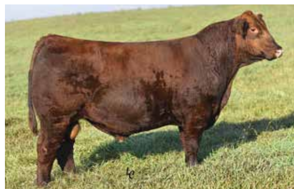
Bieber Deep End B597 - Sire of Lot 16