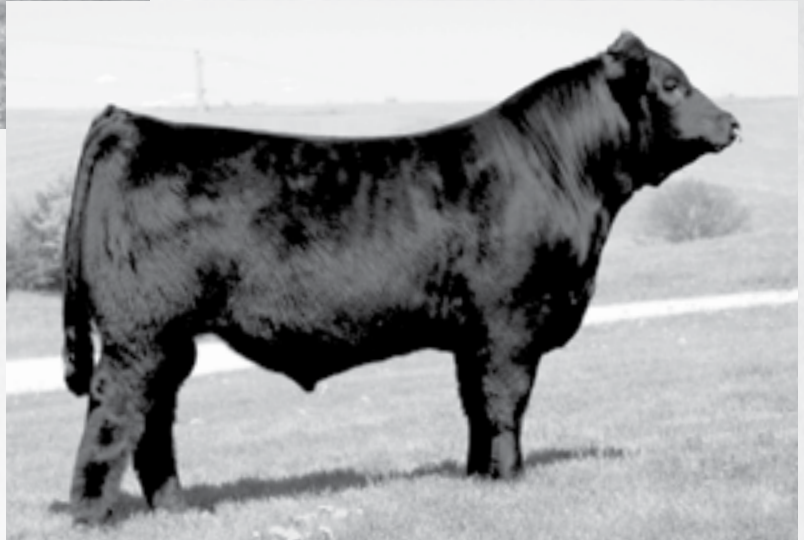
CJSL WILD WEST 9060W | Paternal grandsire of Lot 25A