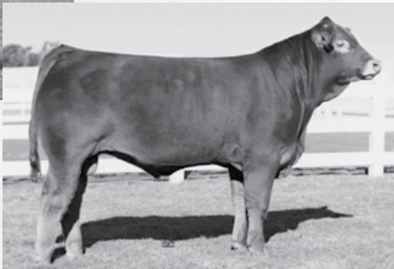
STZZ POLLED YUKON 50E | Maternal grandsire of Lot 214