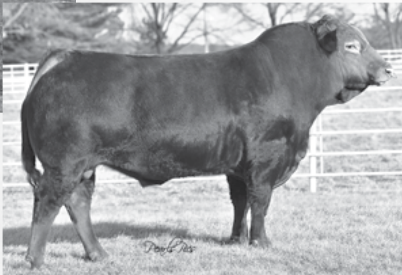
GTMO BALFOUR 08B | Service sire to Lots 42, 43 & 44