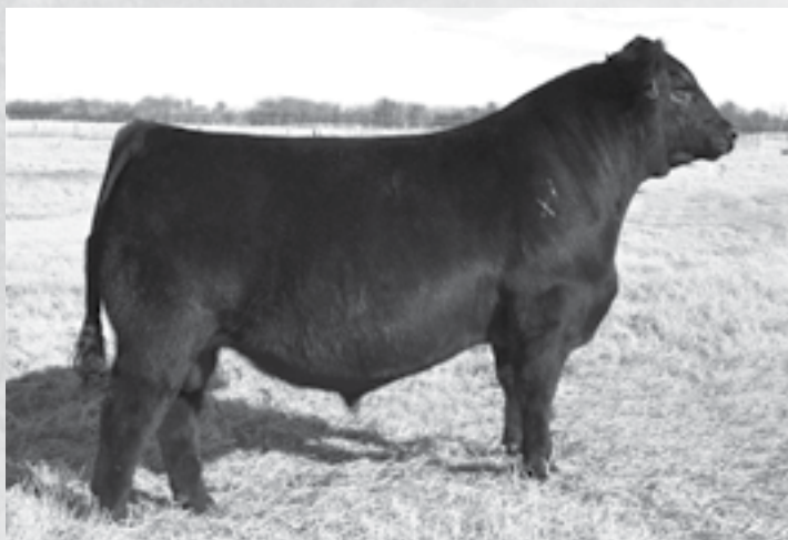
EXAR DENVER 2002B | Paternal grandsire of Lot 72