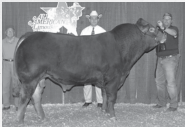
SVL POLLED EXCLUSIVE 412T | Paternal grandsire of Lot 67

DWR Adele 152E is a yearling fullblood female from the Diamond W Ranch. Strong performance and maternal lines make this heifer an ideal fullblood replacement female.