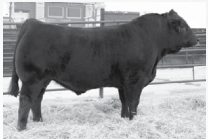
RUNL ALLIANCE 272A | Sire of Lots 77 &amp; 78

POPS Alliance Daisy 566D is a paternal sister to Lot 76. These females are in the fore front of the business and they will make a positive impact on the breed for years to come.