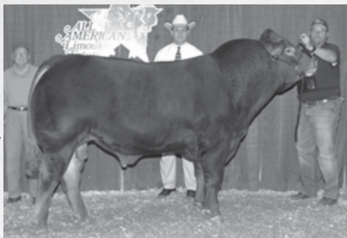
SVL POLLED EXCLUSIVE 412T | Maternal grandsire of Lot 6