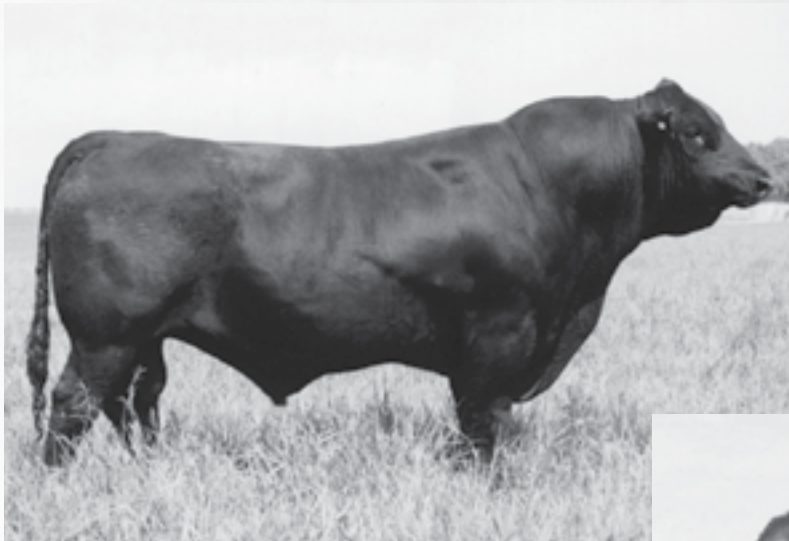
TNUH BLUE PRINT 245H | Paternal grandsire of Lot 29