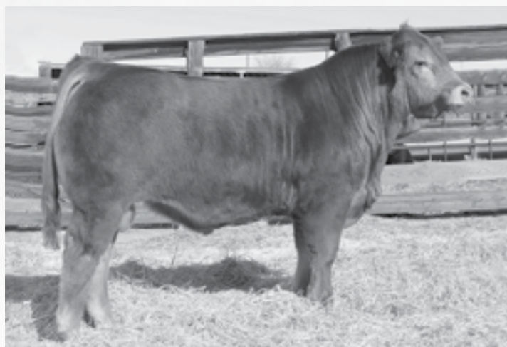
WULFS AMAZING BULL T341A | Sire of Lot 7