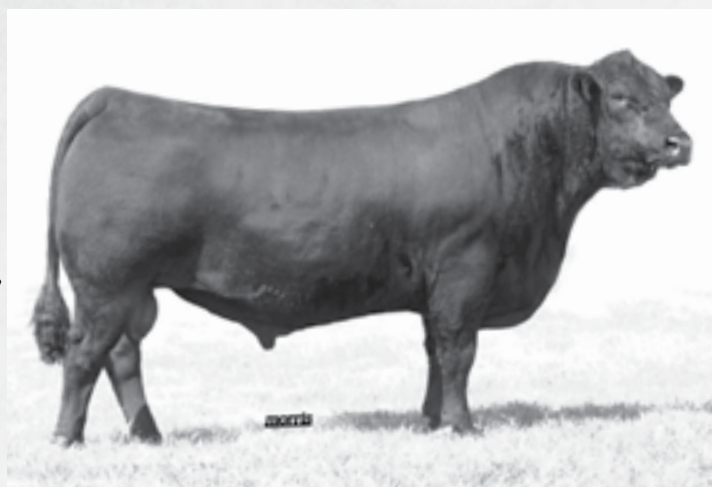
AUTO DOLLAR GENERAL 122R | Sire of Lot 22

MAGS Coffee Color has been an excellent breeding bull in the End of Trail breeding program. The son of MAGS Zappo has been an easy calver, and he is leaving exceptional progeny in the program. This young herd sire is a special lot for the bull buyer wanting a proven herd in every way.