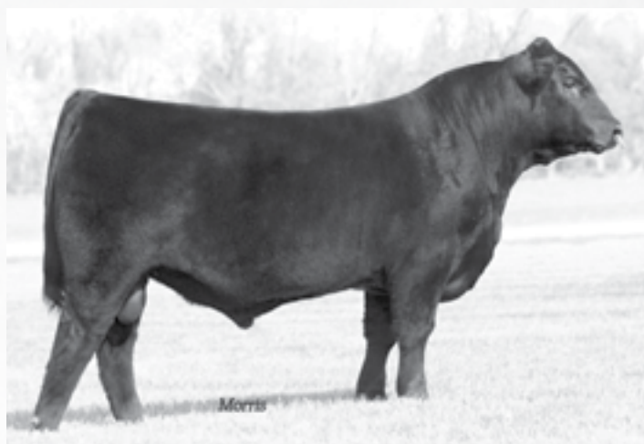
MAGS Y-AXIS | Paternal grandsire of Lot 11

ODGN Dark Coffee 105D is a high performing son of the senior herd sire, MAGS Admiralty. Impressive EPDs coupled with impressive performance numbers make this an excellent growth and maternal bull for the purebred and commercial producer. The Lim-Flex breeding bull was selected from the Odglen bulls for this sale offering.