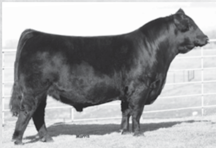
MAGS ZAPPO | Sire of Lot 21