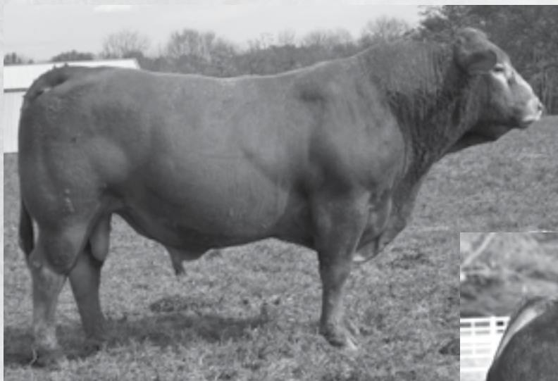
EAFF POLLED PUGILIST 633R | Paternal grandsire of Lots 42, 43 & 44