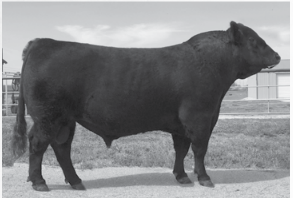
KELO ALEXANDER X RAY | Service sire of Lot 56