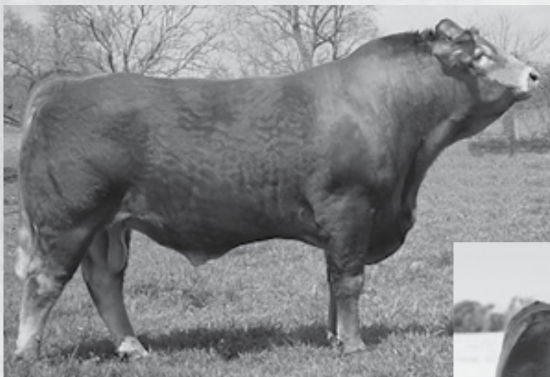
EAFF HAMLET 272K | Maternal grandsire of Lot 212