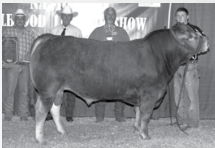
FL POLLED TOUCHABLE 311A | Paternal grandsire of Lot 70

LVIE Cold Touch is a Garrison-bred female that has many generations of noteworthy individuals that make up the breed-leading pedigree. A 33 for maternal EPD offers trait-leading maternal power.