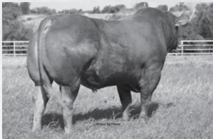
CF JIM DANDIE 216U | Sire of Lot 15

Osage Valley Kingpin 964C is the fourth homozygous polled and homozygous black purebred bull from the Williams program. Years of selection have been invested into the pedigree and performance of these half brothers. They represent the Williams program in a great way.