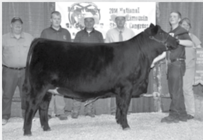
CLTM ZSA ZSA | Maternal sister to Lot 51

CLTM Dream Catcher 2C ET is a daughter of CALO Brickyard 902W and MAGS Ricochet, the donor female that has made such an impact upon the Mosher program. This female is a maternal sister to CLTM Zsa Zsa, the impressive show female successfully campaigned by the Mosher family. This is an excellent breeding female offered by the Mosher family from the depth of the breeding program.