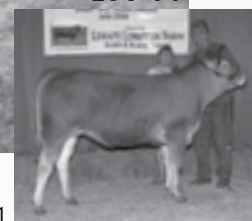
RJRD'S PRECIOUS | Dam of Lot 71