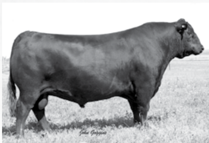
CONNEALY CONSENSUS 7229 | Paternal grandsire of Lot 68

DWR Greta 150E is a fullblood female from the Diamond W Ranch breeding program. Mainline genetics are offered in the pedigree of this performance-oriented yearling female.