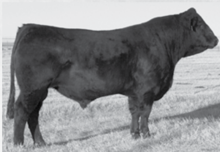
MCBN TARGET 705T | Paternal grandsire of Lot 2

JABI Heavy Gauge 006 is a yearling herd sire prospect from the Ball Ranch. He is a balanced combination of many generations of polled and black lineage of seedstock. He has a strong maternal pedigree and is an exceptional breeding bull offered from the Ball program.