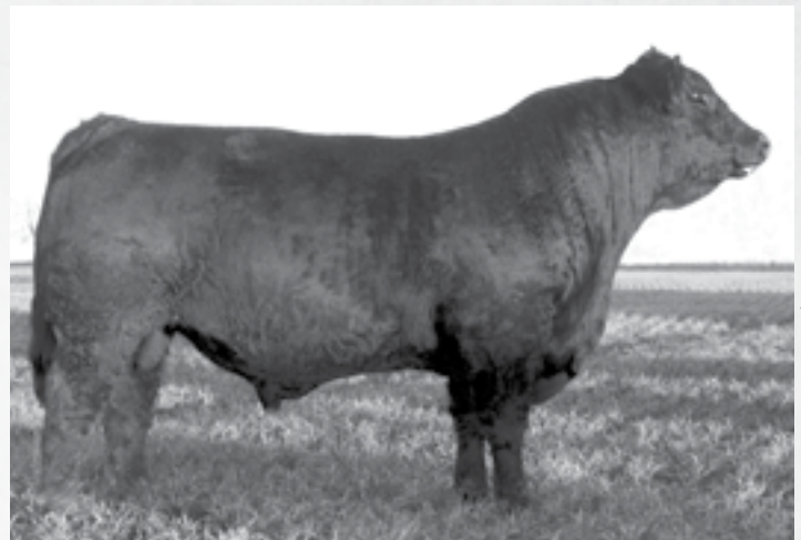
KRVN PACESETTER 053P | Maternal grandsire of Lot 77

POPS Alliance Jody 571D is a polled and black purebred female from the Payne program. She has balanced EPDs with an exceptionally strong maternal EPD. She is smooth as glass and this female is ready to breed.