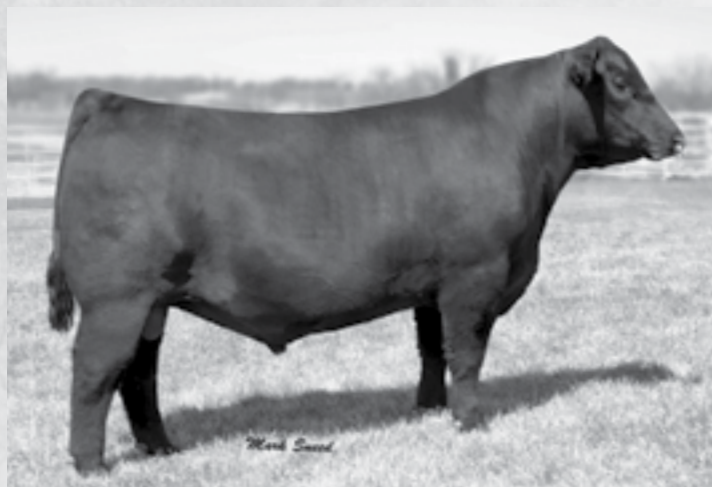
S A V BRILLIANCE 8077 | Paternal grandsire of Lot 12