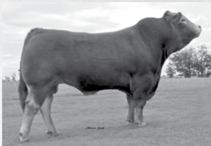
TLSE AMERICAN IDOL | Sire of Lot 8

DIAR December is a fullblood bull from the very best bloodlines. He is by the popular TLSE American Idol, and from some of the oldest and most proven blood in the business. This is a powerful fullblood bull.