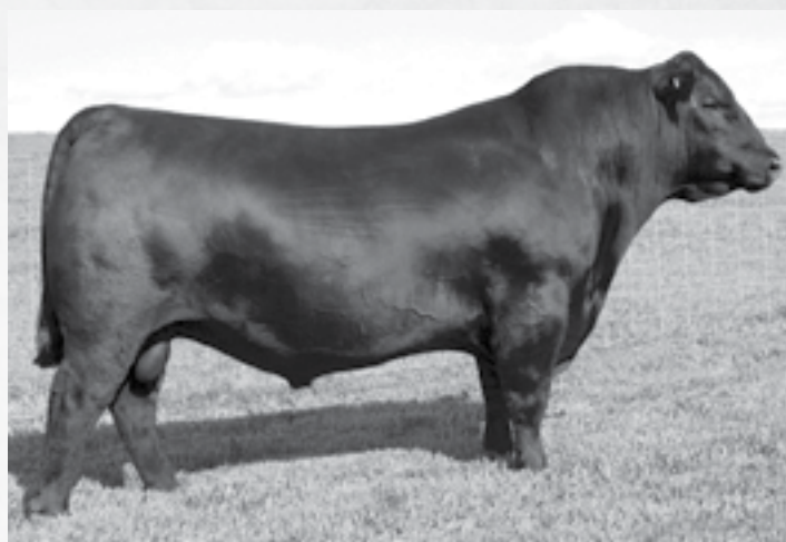
S A V BISMARCK 5682 | Paternal grandsire of Lot 3

ODGN Elmo 120E is from a long line of multiple generations of Lim-Flex bloodlines. He is from the Odglen breeding program, one of the largest Limousin breeding establishments in the country. Nicely balanced EPDs and phenotype make this a good choice for problem-free genetics.