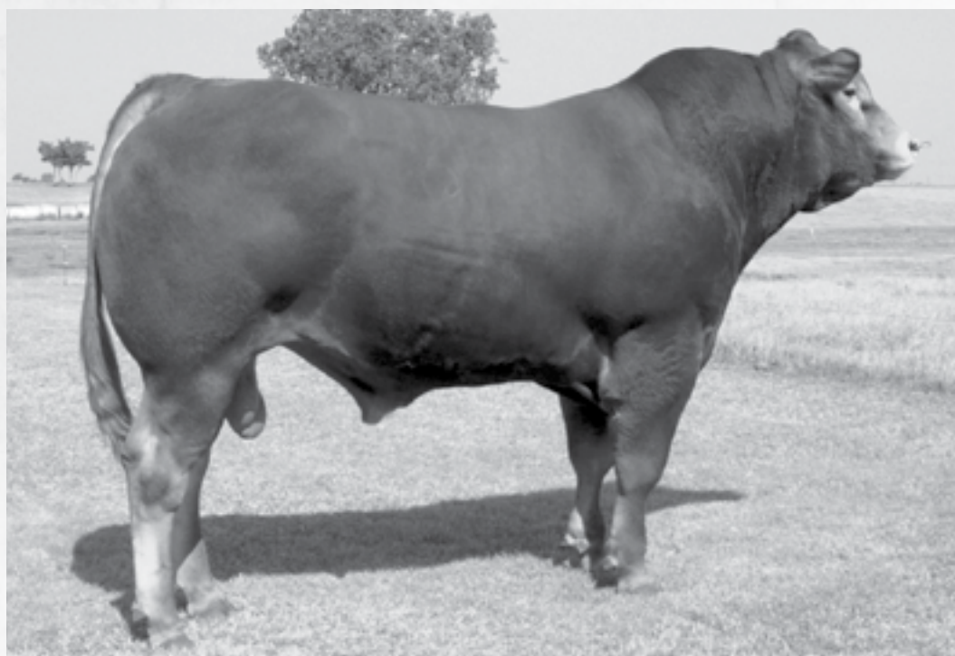
CFSV POLLED EXCEL 3155 | Paternal grandsire of Lots 13 &amp; 14

ODGN Dillard 091D is a homozygous black son of HBRL Blitz 8077, one of the top herd sires in the Odglen program. He is bred from some of the top performance lines in the industry. Years of selection is apparent in the pedigree of this good bull.