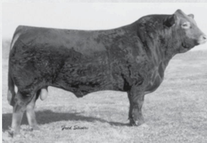
EAFF REJUVENATOR 260J | Maternal grandsire of Lot 207

Windy is from the LL Delara 408 cow family. This is a strong maternal pedigree.