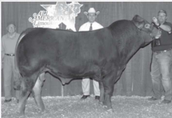
SVL POLLED EXCLUSIVE 412T | Paternal grandsire of Lot 49