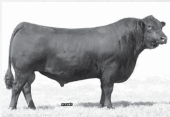
AUTO DOLLAR GENERAL 122R | Paternal grandsire of Lot 46

ODGN Days Inn 023D is a multiple generational Lim-Flex female genetically derived from the very best blood in the industry. She has impressive EPDs and she has been bred from some of the foundation bloodlines in the breed. She sells as an excellent replacement female.