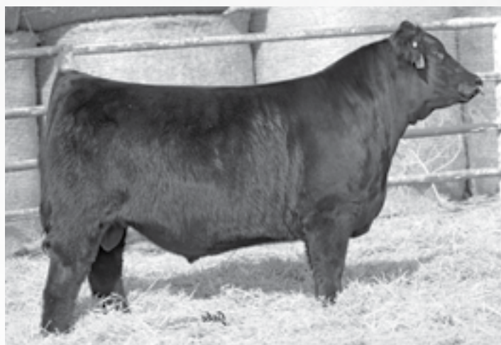
SCHILLING'S DITKA | Service sire to Lot 47

WTMR Diamond 67D is a Lim-Flex female of the highest quality from the Mosher family. She sells bred to Schillings Ditka, the Mosher breeding bull that is making a big impact in the Mosher breeding herd. The Mosher family offers excellent genetics in the sale line up of the Round Up.