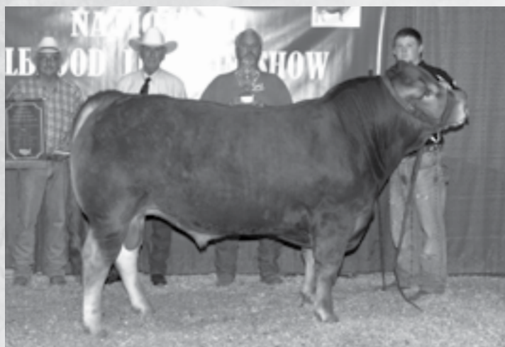
FL POLLED TOUCHABLE 311A | Paternal grandsire of Lot 5 &amp; Sire of Lot 6