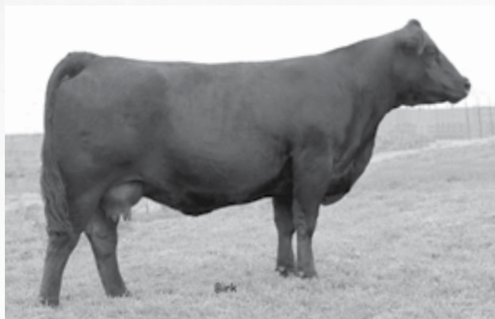
L7 YUMA 122Y | Dam of Lot 1