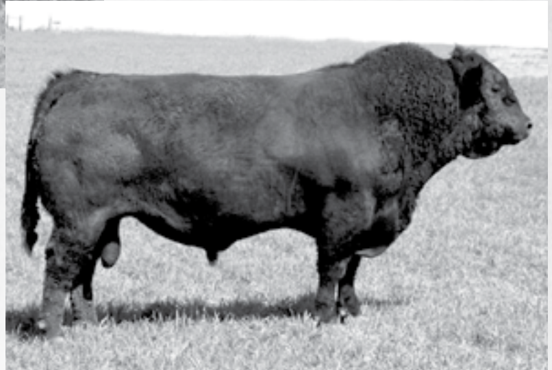
LH RODEMASTER 338R | Paternal grandsire of Lot 41