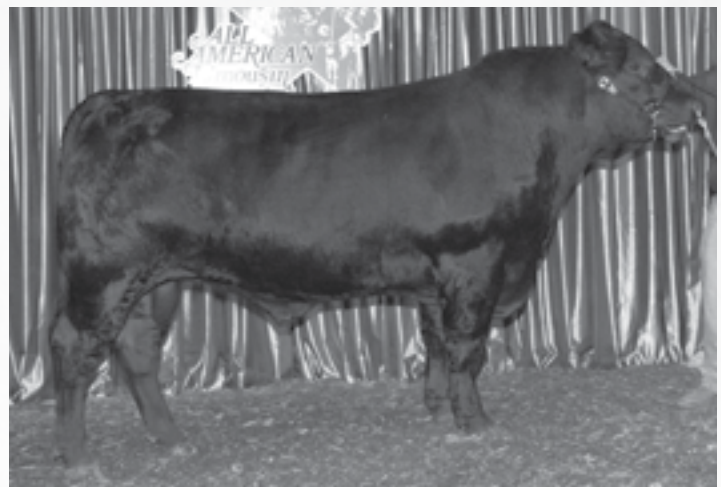
SEVO BOOTLEGGER | Maternal grandsire of Lot 65

SEVO Erica is a purebred female by AUTO City Limits 154A, the good breeding bull by EBFL Ypsilanti 420Y. She has a 29 for milking ability EPD, and sells as a noted replacement female from Seven Oaks Limousin Ranch.