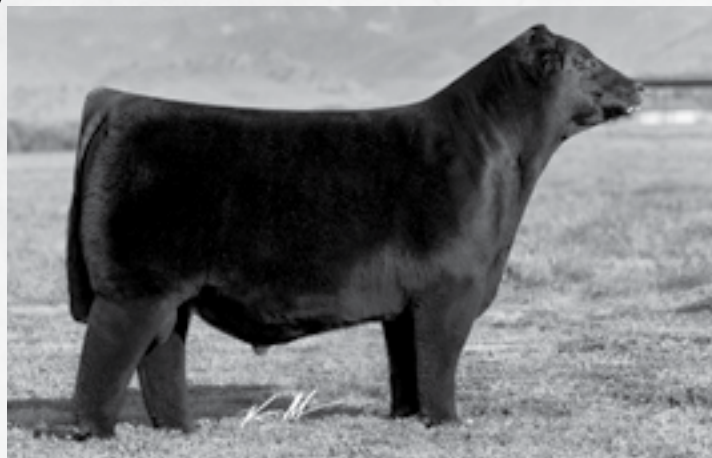
COLBURN PRIMO 5153 | Sire of Lot 1