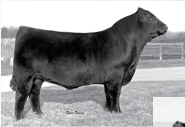
C L BURBANK | Paternal grandsire of Lot 24