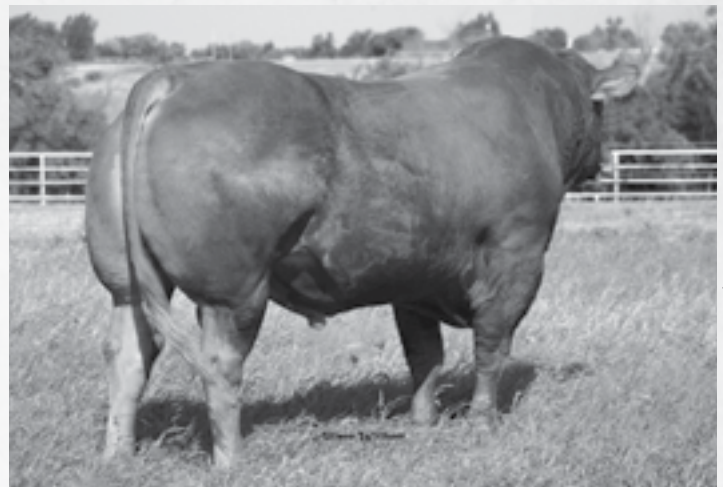
CF JIM DANDIE 216U | Full sib to Lot 81

These embryos will be full sibs to CF Jim Dandie 216U, certainly one of the most appreciated breeding sires in the industry today. His progeny have become highly sought after and they are being utilized in some of the top breeding herds in the nation.