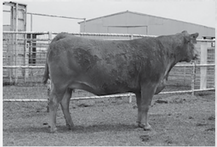
CF POLLED DANDIE 040P | Dam of Lot 81