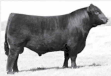
SPRNG CRKS URLACHER 311U | Sire of Lots 55 & 56