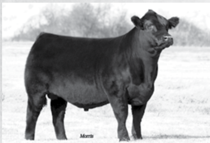
CALO BRICKYARD 902W | Sire of Lot 58