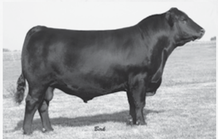
TYEJ-TNGC FORMULA ONE 321 | Sire of Lot 57

No accident at all, this young heifer calf has the genetic backing to become one of the great show heifer calves to show this year, and a great breeding female beyond.