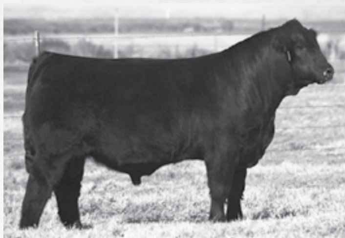
KRVN PABLO 011P | Sire of Lot 52

HUTR Vickie 4 is a daughter of KRVN Pablo 011P. The purebred female is from some of the strongest foundation blood, and she is an excellent offering from Martin Limousin.