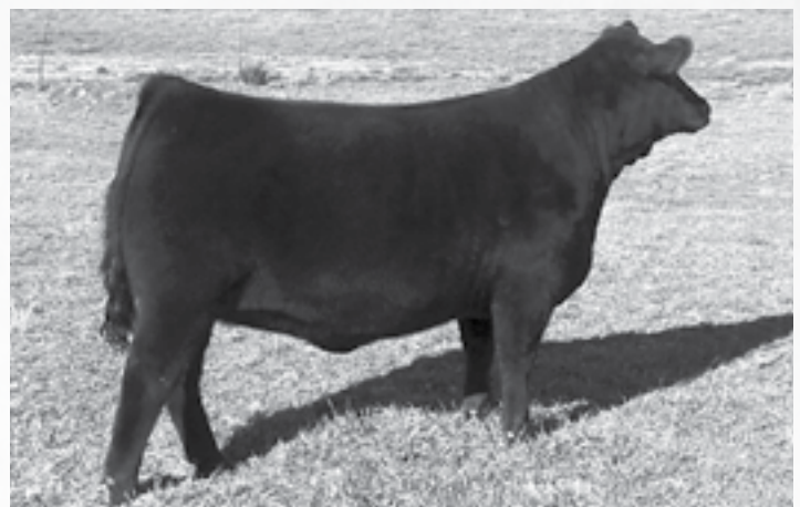
NHCA YUMA 922Y | Maternal grandam of Lot 57