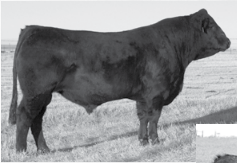
MCBN TARGET 705T | Sire of Lot 40