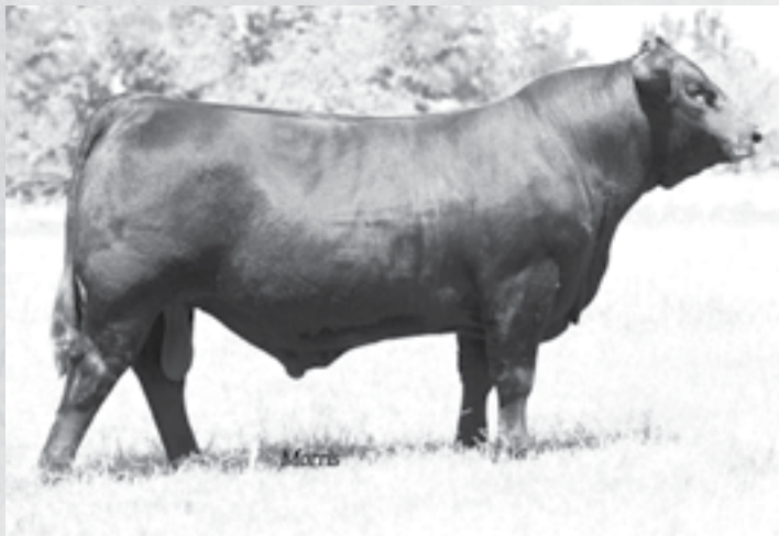
EBFL YPSILANTI 420Y | Paternal grandsire of Lot 48