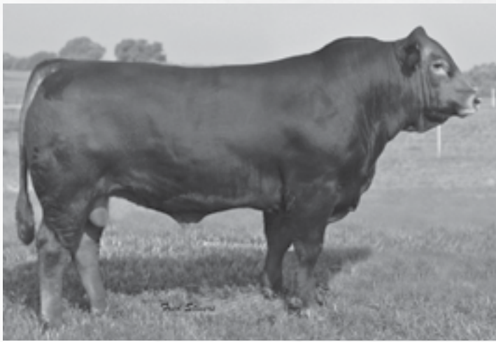
EAFF POLLED HUMMER 530P | Sire of Lot 81