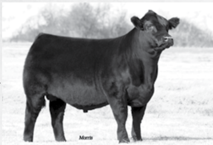
CALO BRICKYARD 902W | Sire of Lot 80

MCBN Target 705T has been the sire of many of the top-selling bulls throughout Oklahoma. He has proven to be one of the best breeding sons of AUTO Dollar General 122R. He is a true performance bull.