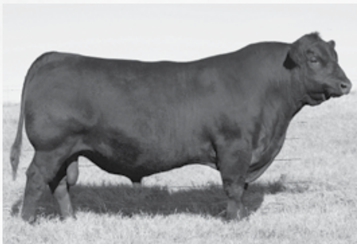
MAGS EAGLE | Paternal grandsire of Lot 50