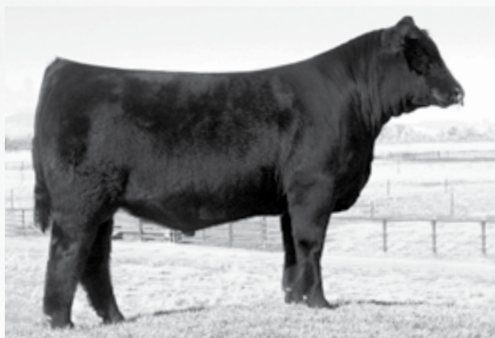
MAGS XUKALANI | Sire of Lot 23

MCBN A Dollar's Worth 373 is an excellent proven breeding bull from the Odglen breeding program. The homozygous polled and homozygous black Lim-Flex herd bull is offered as a special lot as a proven breeding bull of exceptional quality.