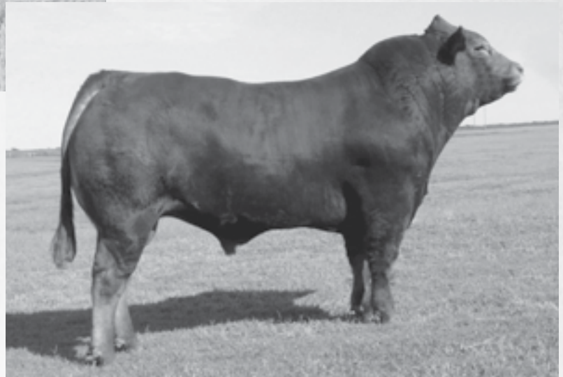
SVL POLLED PROFIT 037N | Paternal grandsire of Lot 30