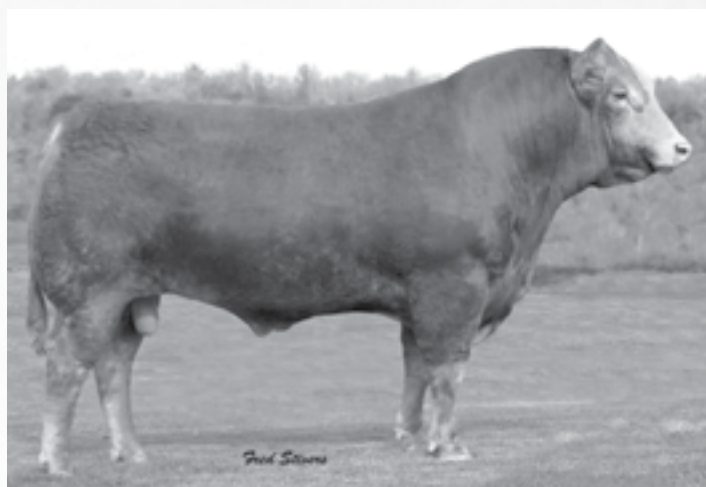
LENAPE POLLED LIBERTY | Maternal grandsire of Lot 4

LVIE Liberty Touch is a polled fullblood bull from the mainline of genetics sourced within the breed. He traces to some of the all-time greats in the breed, and is an exceptional individual for a breeding program. He has a strong maternal EPD of 31.