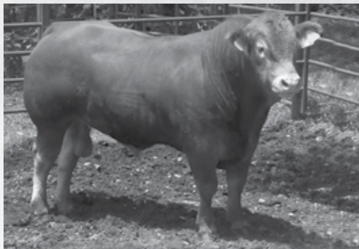
SVL POLLED FRANCHISE 986Z | Sire of Lot 45

Rockin' R Bathsheba 6C is a replacement purebred female from the Rockin R breeding program. She is powerfully stacked with the best lines of Limousin seedstock available in the industry. Her fullblood sire is one of the high performing sons of SVL Polled Advance 534U.