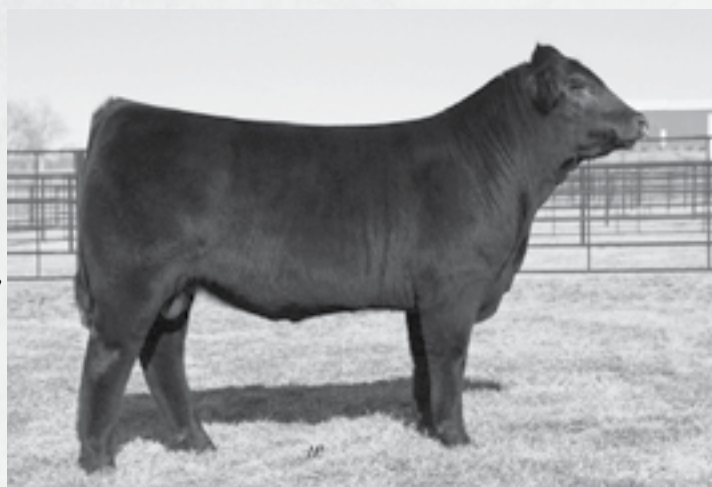
DVFC WARDEN 233K | Sire of Lots 59 & 60