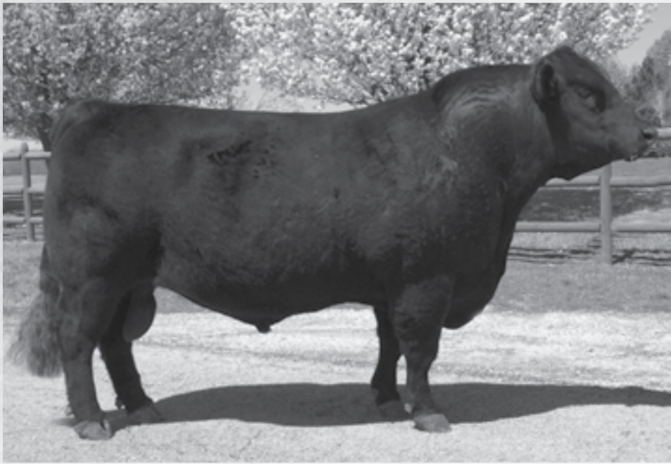
MAGS XRAYS | Service sire of Lot 55