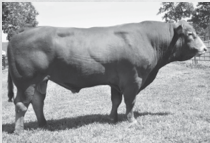
CFSV POLLED NEWSTAR 730X | Paternal grandsire of Lot 66